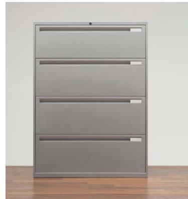
Similar- no front on top shelf.

Description: Three drawer high metal cabinet with one additional open shelf unit. Full pulls across front of each drawer. Top three drawers openings have receding doors and roll out shelves. The bottom drawer has fixed front. Each drawer has side to side file bars, and each cabinet has a lock. Cabinets have counterweights to meet codes.