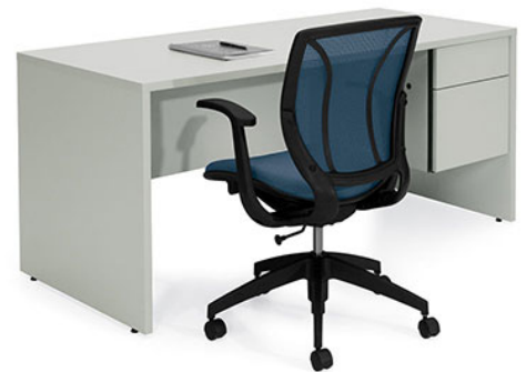
Similar- with hutch and tack bd.

Location: 109, 110, 111, 112, 115, 120, 123, 126, 148, 149, 150, 153, 155, 180B