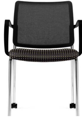
Similar- no arms no casters.

Code: C4 SIDE CHAIR Without arms. Item: Mid back,side chairs without arms. Similar to: Global Murano 8291MG N1 Mid back side chair Quantity: 34 Dimensions: 18.5" wide x 21.5" deep x 32.5" high. Description: Mid back side chair with mesh back and upholstered seat, cantilever base and glides. Finish: Black mesh back, Black arms Vinyl seat- 50% of each-Tessuto colour- 20 Malta and 17 Seneca. Location: 209, 213, 220, 222 x 3, 225, 231 x 4, 232 x 2, 240, 241, 243 x 2, 247, 248, 249, 276 x3, 278 x4, 279C x3, 279D x 3, 286.