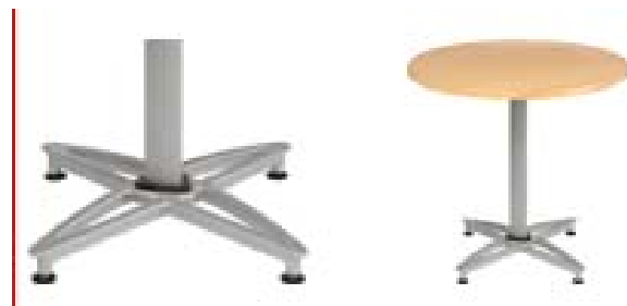
similar- with square tops.