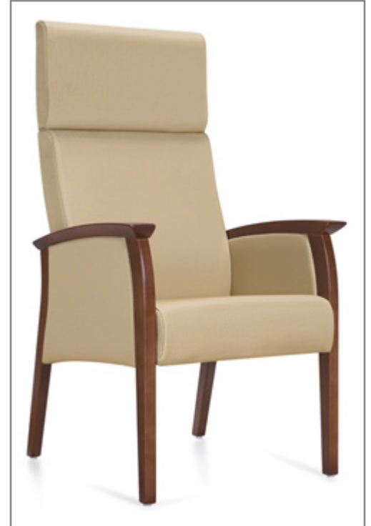
similar- open sides, one piece back.

Finish: Maple chair frame- Avant Honey. Vinyl upholstery seat and back. 8 chairs- Maharam, Chime 465350, 010 Peacock. 8 chairs- Maharam, Chime 465350, 018 Copper.