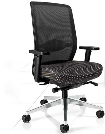
Similar- no lumbar support