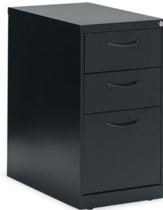
Similar- on casters.

Location: 106 x 3, 142, 160, 206 x 3, 208 x 3.